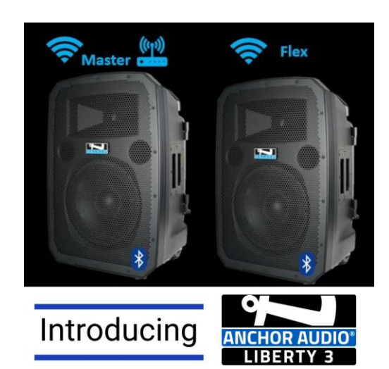
Introducing the Liberty 3