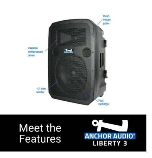
Liberty 3 New Features