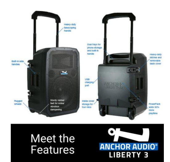
Liberty 3 Features - Portable and Rugged